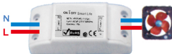
Ceiling lamp wiring instruction