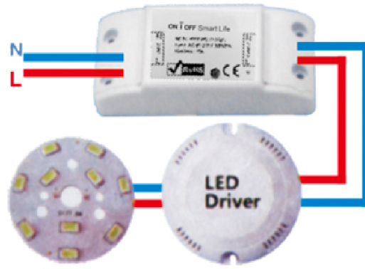
One wire wiring instruction